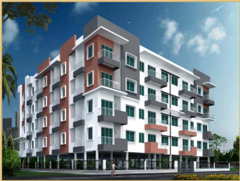
Saritha Opulence / No of Flats: 48 / Year: 2015