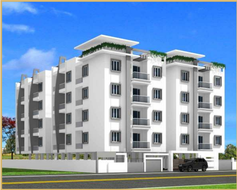
Saritha Elegance / No of Flats: 32 / Year: 2012

“I came to know about the developers through my sister. All the promises, features and amenities everything what they showed me in the brochure, they did it as per promise. Builders are open to suggestions, when we were designing our house, we could make all the changes that we wanted in our house. I am very happy that the builder addresses our concerns even now, if we have any. ”