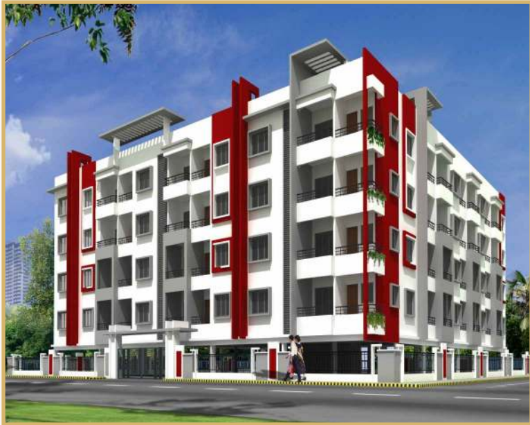
Saritha Ambience / No of Flats: 44 / Year: 2014