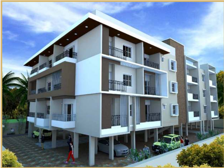
Saritha Elan / No of Flats: 24 / Year: 2017